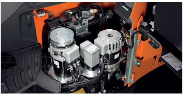
BT Reflex R-series has durability designed-in with its sealed electrical units, brushless motors and leak-free connectors