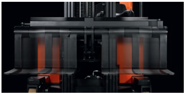
The BT Reflex F-series can spread its forks over a range of 0.54 m to 2.22 m

Unique to the F-series, the driver faces in the same direction as the forks, giving the best view of the long loads that the F-series is designed to handle. The truck can drive in any direction, which, combined with its hydraulic fork spreading, makes the F-series a very versatile truck for horizontal and vertical handling.