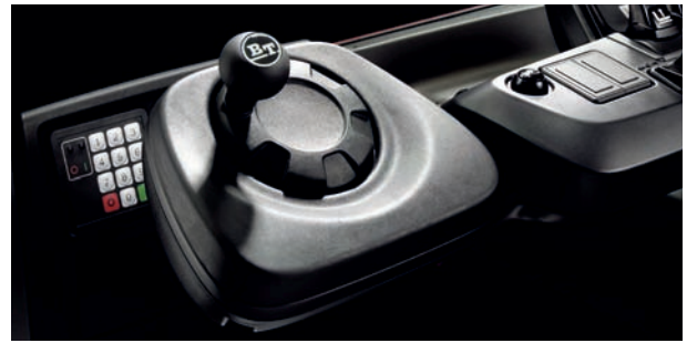
BT Reflex N-series' electronic, progressive 360° steering is perhaps the most significant contribution to the driving experience

'E' stands for efficiency and effective integration with warehouse management systems. The E-bar is a universal mount for warehouse management devices such as on-board computers, radio data terminals, and barcode readers. It can be equipped with an integral 12 V or 24 V DC power supply, ensuring that Reflex N-series is ready to fit into any application.