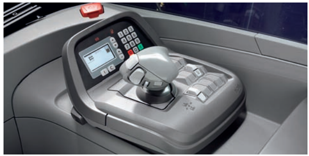
An optional multifunction control unit can be selected, depending on the preference and experience of your drivers