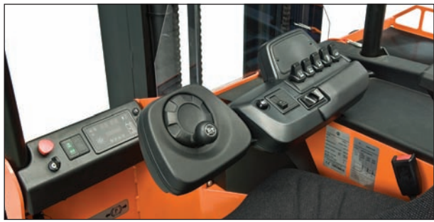
The cabin is spacious and comfortable, and the controls offer fingertip operation, for precise and effort-free load handling