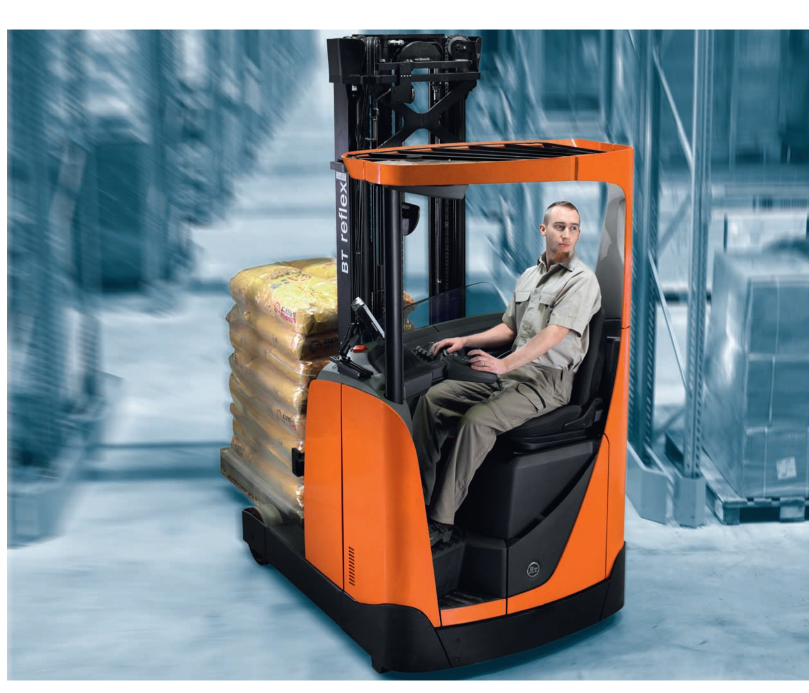
1.4 – 2.5 tons Reach Trucks