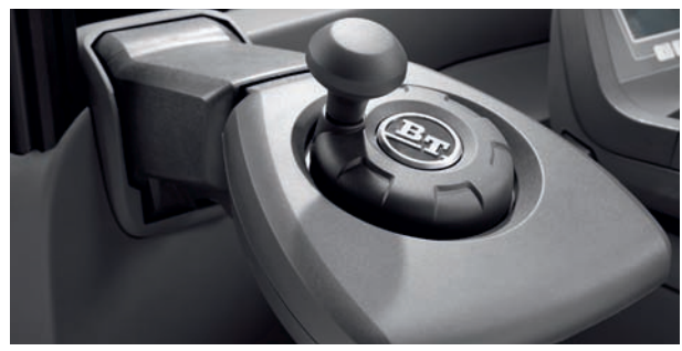
The advanced 360° steering system on all BT Reflex trucks allows exceptional manoeuvrability