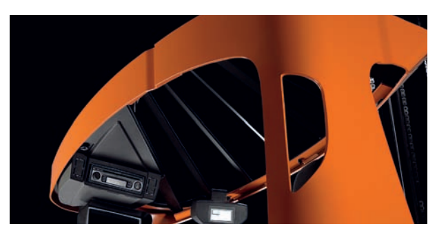
BT carefully considered all aspects of visibility during the design process

Having a clear, unobstructed view throughout the handling process is essential for maintaining maximum safety standards. BT Reflex has carefully considered all aspects of visibility. We call it 'BT Totalview'.