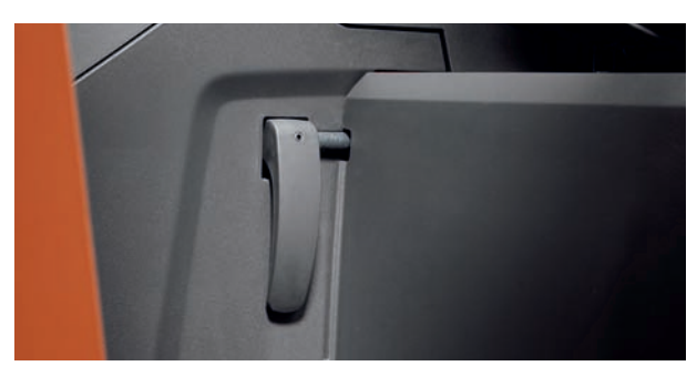
The battery is manually released with a lever on the battery wall enabling easy battery change without the operator needing to dismount

BT Reflex trucks are powered by AC motors, which ensure maximum energy efficiency. Consumption rates are low on all BT Reflex models, with the added benefit of energy being recycled on deceleration and braking. For multi-shift operations these trucks can interface with battery change systems and the battery can be quickly and easily power-released while the driver is seated in the cab.