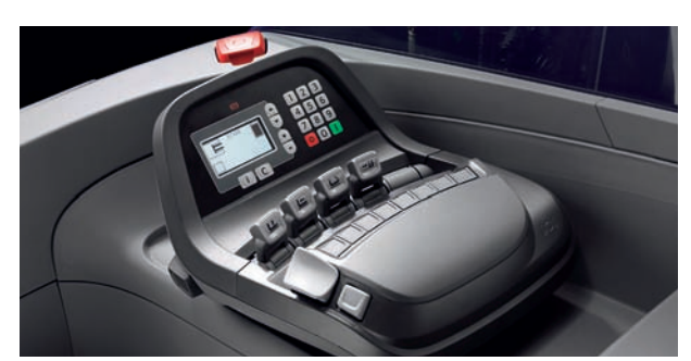
Standard mini-levers allow fingertip control of each fork movement

This enables the driver to check that loads are within the rated capacity for the truck. It also allows loads weights to be verified as part of the handling process.