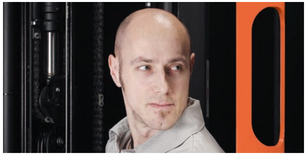
The design of the cab not only provides panoramic vision for the operator, but also provides excellent protection — the operator is fully contained within the profile of the cab