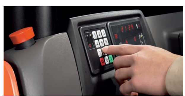
Unique to BT, N-series offers PIN-code entry as standard to ensure that the truck is only used by authorised personnel